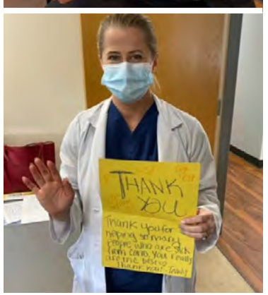
Local healthcare workers proudly display their thank you notes.