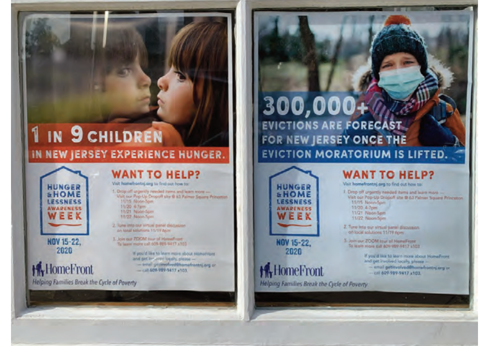
The window at our pop-up donation and information center in Palmer Square.

Either way, COVID-19 won't stop Santa this year!