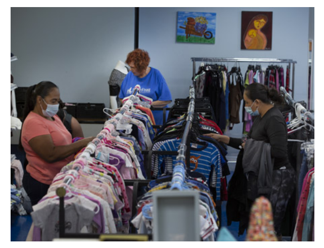
HomeFront's FreeStore on Division Street in Trenton.

When you drop off items at our Donation Center, do you know where they go? HomeFront sends all new and gently used clothing, linens, towels, housewares, and more to our FreeStore, conveniently located on Division Street in Trenton. The FreeStore provides a valuable resource for families in need, allowing them to shop for items they need, without the worry of additional expenses. Your generous donations have a direct and positive impact on the lives of thousands of families each year — This past August alone, 331 families visited the FreeStore, a significant 31% increase from last year!